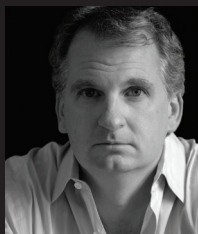
TIMOTHY SNYDER RICHARD C. LEVIN PROFESSOR OF HISTORY, YALE UNIVERSITY

Keynote: On Tyranny: The Rise of Modern Authoritarianism in Europe and America